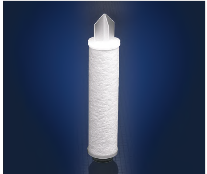
Nexis A Filter Cartridges